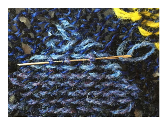
3. Work in the opposite direction, inserting the needle through the MC floats on the next row below; pull the needle and CC through and snip off the remaing CC end