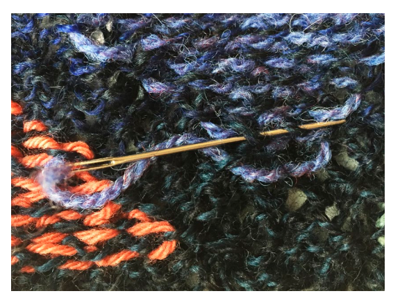
2. Insert the needle through MC stranding floats parallel to the stranding floats and pull the CC yarn through