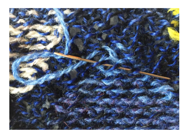
2. Insert the needle through MC stranding floats parallel to the stranding floats and pull the CC yarn through