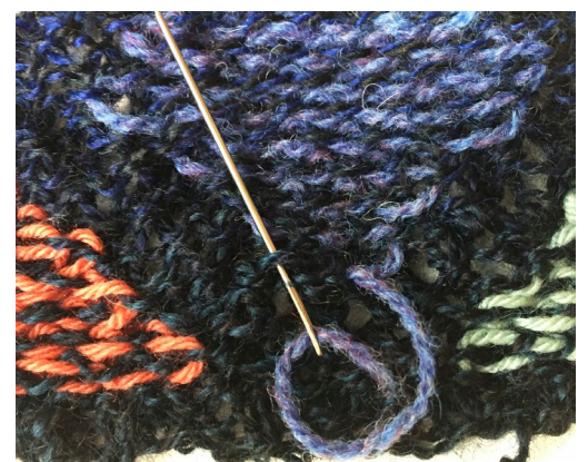
1. Thread the CC yarn end onto the needle, insert the needle through the back of an adjacent MC stitch and pull the CC through