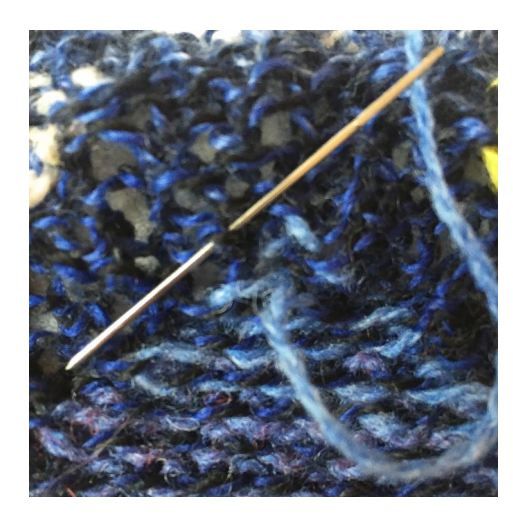
5. For the top of the diamond, thread the needle and insert it through the back of an adjacent MC stitch and pull the CC through