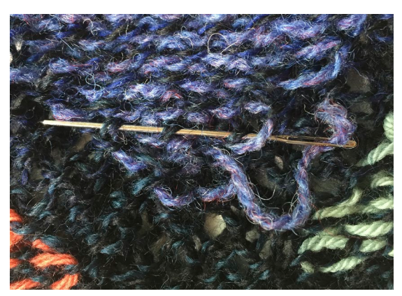
3. Work in the opposite direction, inserting the needle through the MC floats on the next row above