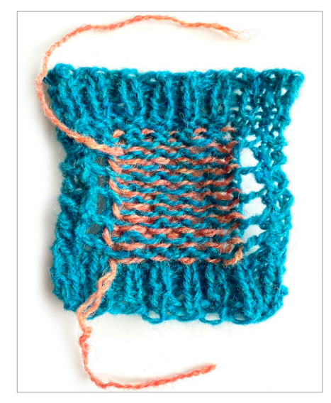
The back of the swatch before weaving in CC ends. The CC has been held below the MC on every row, creating a uniform arrangement of floats.