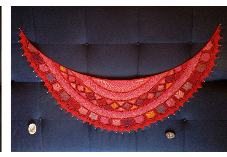
6. a final stretch & reposition for symmetry and even distribution of points